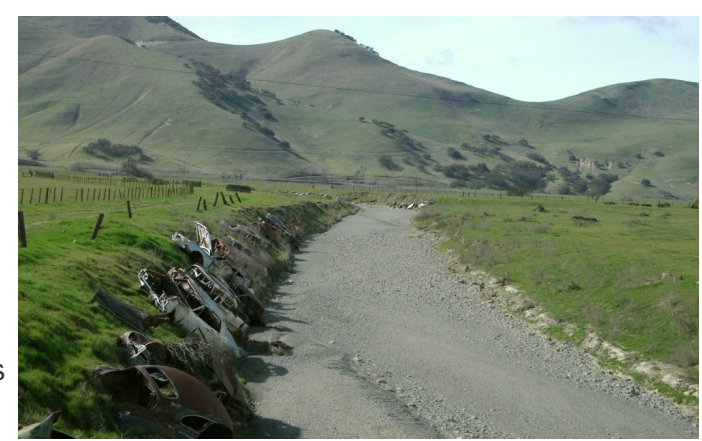
Vintage Cars on Banks of Lewis Creek

I am expecting we will see carpets of color from the fields of poppies, gold fields, lupines, and fiddleneck. And we may get to see the antique cars that are planted on the banks of Lewis Creek in Lonoak.