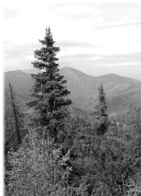
Santa Lucia Fir P772