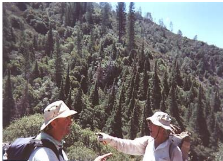
Chase scholars discuss the route up the San Carpóforo Canyon, with Santa Lucia Fir Abies bracteata in the background.

Recently, I found and purchased the book “California Coast Trails: A Horseback Ride from Mexico to Oregon in 1911” by J. Smeaton Chase. On his 2000 mile ride along the California coast one of his goals was to see a Santa Lucia Fir.