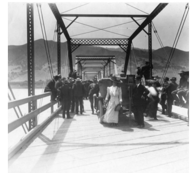
Opening of San Ardo Bridge April 1908